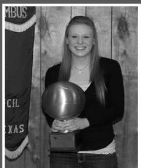
2008 State Winner